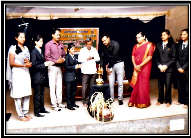
Hire Mee Bangalore has conducted Campus Drive on 5/8/2019