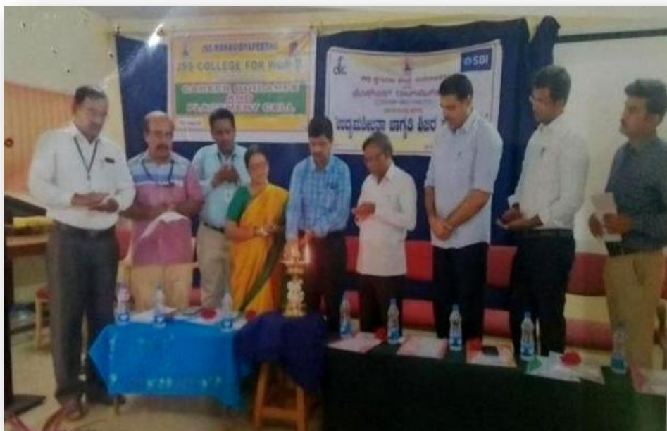
Program Inauguration by guests

Number of beneficiaries: 150 students were participated