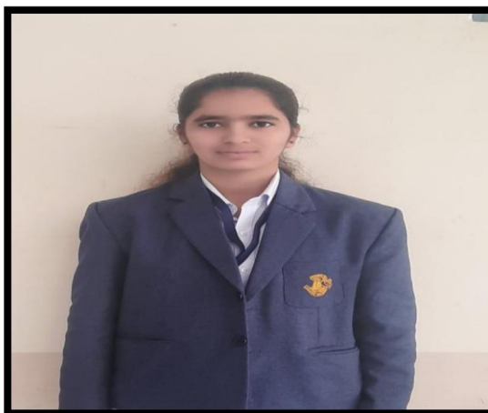
Uniform for BBA/BCA