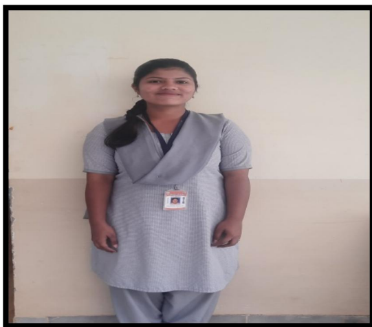
Uniform for BA/B.Sc/B.Com

College has provided students with ID card which is mandatory to be worn by the students as well as college is having uniform facility to its students which bring a kind of oneness and acts as a Criterion for the security. The uniform has not changed for five years