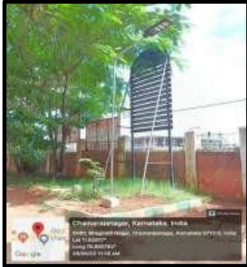
Located in the entrance

Ph.: 08226-222076 & FAX: 08226-226505 Website:jsscwn.com E-mail : jsscwn@gmail.com