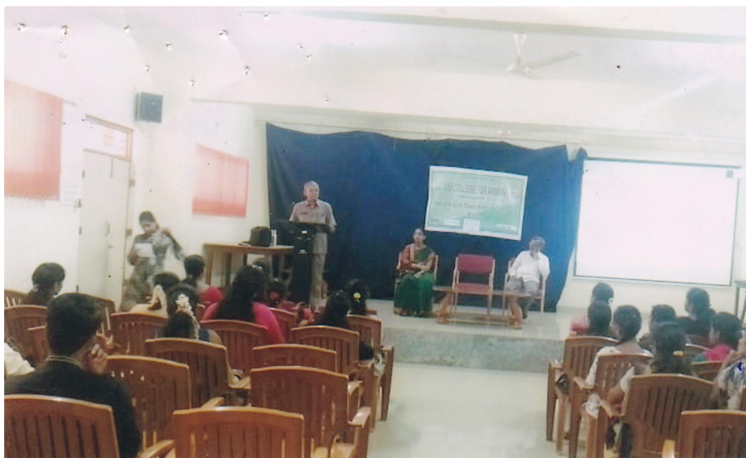
One day orientation programme on Date : 21.10.201 “Preparation for NET and KSET exams”