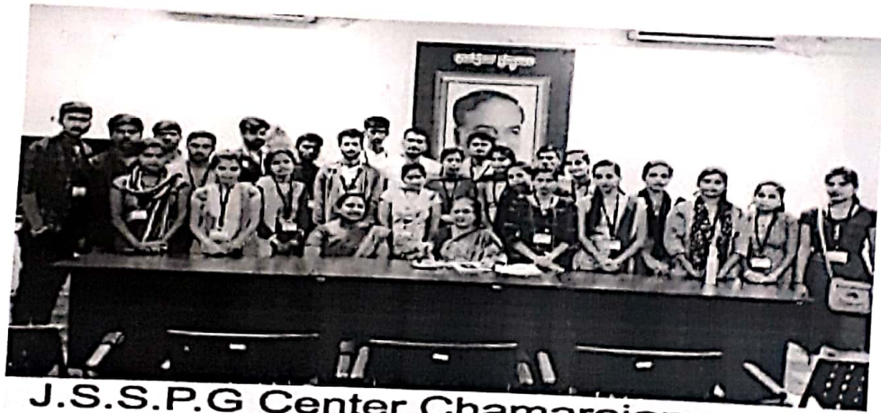
J.S.S.P.G Center Chamarajanagara Visit to Adamyia Chetana 22.08.2019 2019-20 IIM.COM

In the beginning of this academic year 2019-20 our department arranged a programme for M.Com students to visit NGO. Students having in their syllabus a subject called Management of Non Profit Organisation as a soft core subject. In order to get the practical experience about NGO management and their field work, our department arranged visit for our students on 22 nd August 2019.