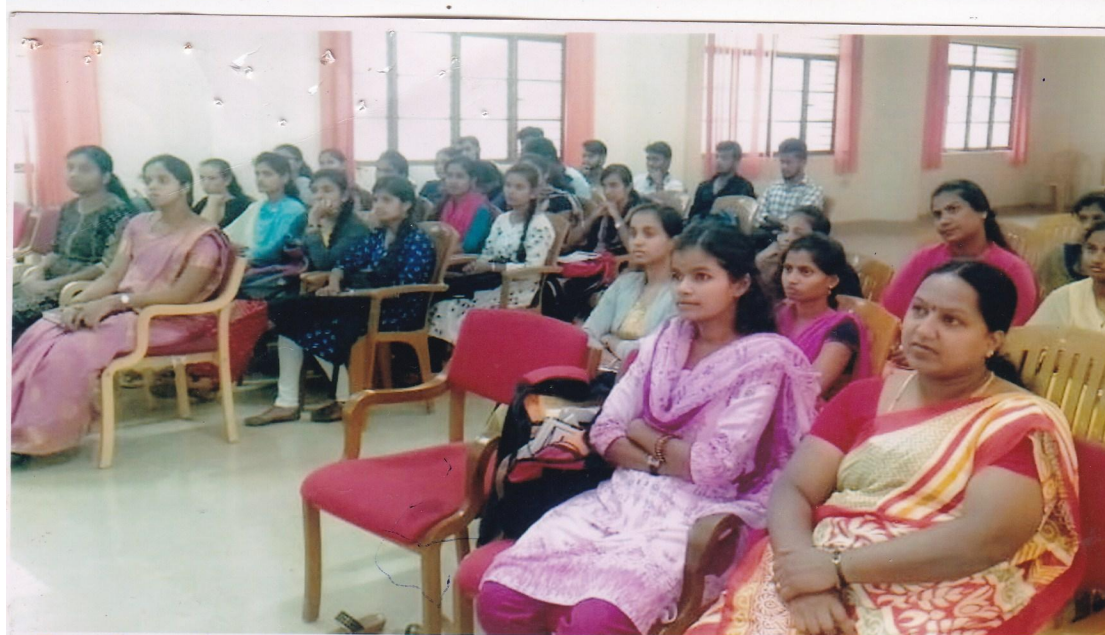
One day orientation programme on Date : 21.10.2019 “Preparation for NET and KSET exams”